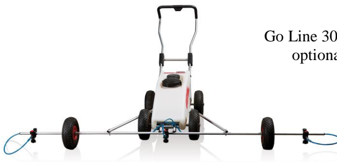
Go Line 30 Machine complete with optional Athletics Marking Attachment.

The side spray arm allows the operator to easily convert the machine to spray to the left or right side of the machine